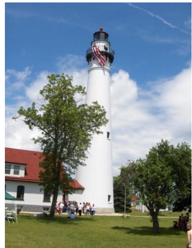
Photo opportunity-just a few minutes' drive from Wingspread. Go East on 4 Mile Road where it will end at Lighthouse Drive. Turn right on Lighthouse Drive and look toward your left to visit the Wind Point Lighthouse, the oldest (built in 1880) and tallest operating lighthouse on Lake Michigan, and the subject of prize-winning photography. The grounds are open to the public for photos and gazing. The tower is open to “climb to the top” on June 13, July 11, August 8, September 12, October 10. Grounds are FREE. Tour is $10.